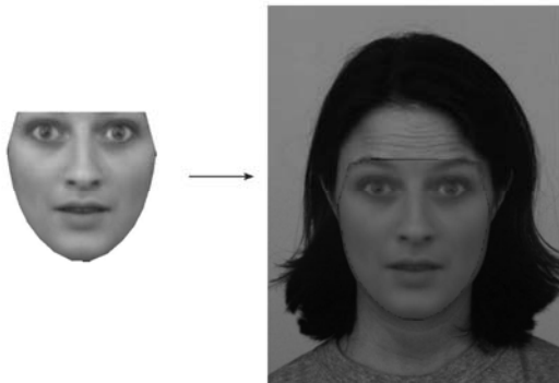
Figure 3. Example of a generated face model.

Below an example is given of a synthesized face or AAM “fit” that can be automatically obtained from a face image. The AAM fit closely resembles the original face and only very little information is lost despite a very large reduction in dimensionality.