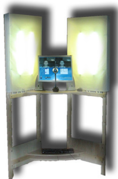
Figure 1. FaceReader demonstrator as shown at Measuring Behavior 2005.

In security contexts, apart from their relevance for person spotting and identification, facial signals play a crucial role in establishing or detracting from credibility. In medicine, facial signals are the direct means to identify when specific mental processes are occurring. In education, pupils' facial expressions inform the teacher of the need to adjust the instructional message. As far as natural interfaces between humans and machines (computers, robots, cars, etc.) are concerned, facial signals provide a way to communicate basic information about needs and demands to the machine. Where the user is looking (i.e., gaze tracking) can be effectively used to free computer users from the classic keyboard and mouse. Also, certain facial signals (e.g., a wink) can be associated with certain commands (e.g., a mouse click) offering an alternative to traditional keyboard and mouse commands. The human ability to read emotions from someone's facial expressions is the basis of facial affect processing that can lead to expanding interfaces with emotional communication and, in turn, to obtaining a more flexible, adaptable, and natural interaction between humans and machines.